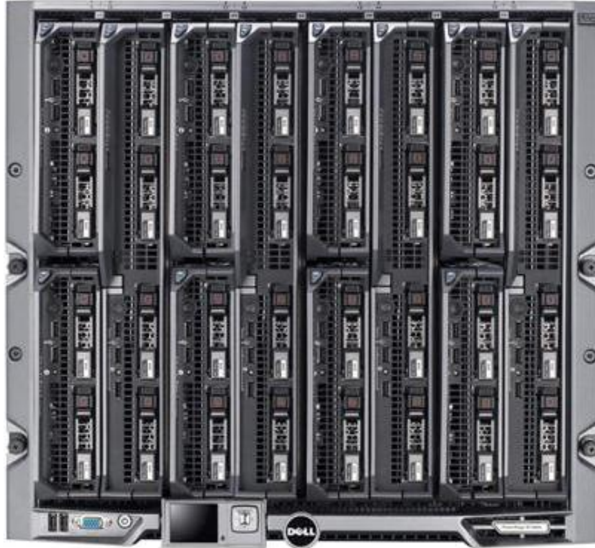
Figure 5. M1000e Chassis

Figure 5 shows the M915 mounted in the PowerEdge M1000e chassis.