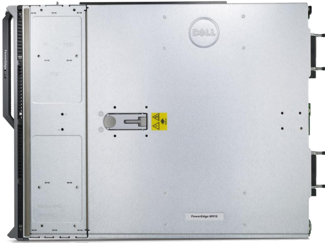
Figure 3. Side View

Figure 3 shows the side view of the M915.