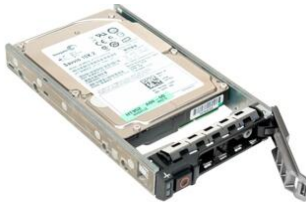
Figure 5. 2.5” HDD Carrier

The PowerEdge M910 supports the 11G 2.5” hard drive carrier. Legacy carriers are not supported on M910.